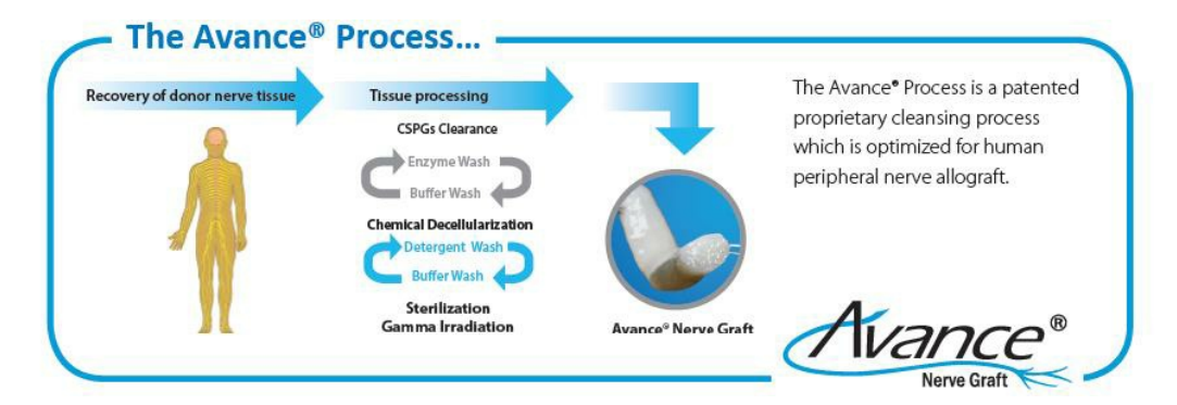
Avance® Nerve Graft and Avive® Soft Tissue Membrane Processing

Over several years, AxoGen has developed the Avance® Process, an advanced and proprietary technique to process the Avance® Nerve Graft from donated human peripheral nerve tissue. The Avance® Process requires special training over several months for each manufacturing associate who processes Avance® Nerve Grafts. The processing and manufacturing system for Avance® Nerve Graft has required significant capital investment, and we plan to make additional investments to continually improve our manufacturing and quality assurance processes and systems. AxoGen's Avance® Process is depicted as follows: